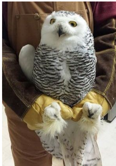
Injured Snowy Owl receiving treatment at the Cobequid Wildlife Rehabilitation Centre, Hilden N.S.

Whatever the reason, Snowy Owls are here in force this winter so enjoy the rare sight. Since the sun never sets during their summer nesting season, these owls are diurnal rather than nocturnal, meaning they are active during the day. Just remember, if you are lucky enough to spot one, they are still a bird of prey so give them plenty of space.