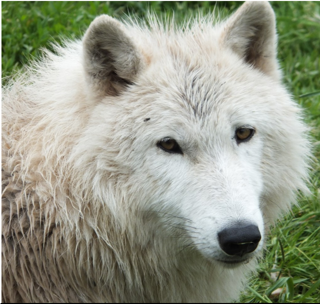
Arctic Wolf at Rest