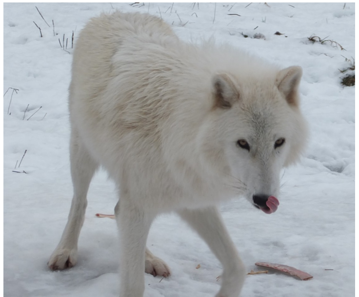
Arctic Wolf Feeding

Fun Facts: Arctic wolves rarely come in contact with humans so didn't suffer the same persecution and near extermination as their cousins the Grey Wolf. This makes Arctic Wolves the only subspecies of wolf that is not threatened or endangered.