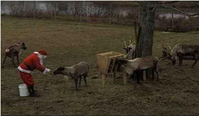
Reindeer and Friend