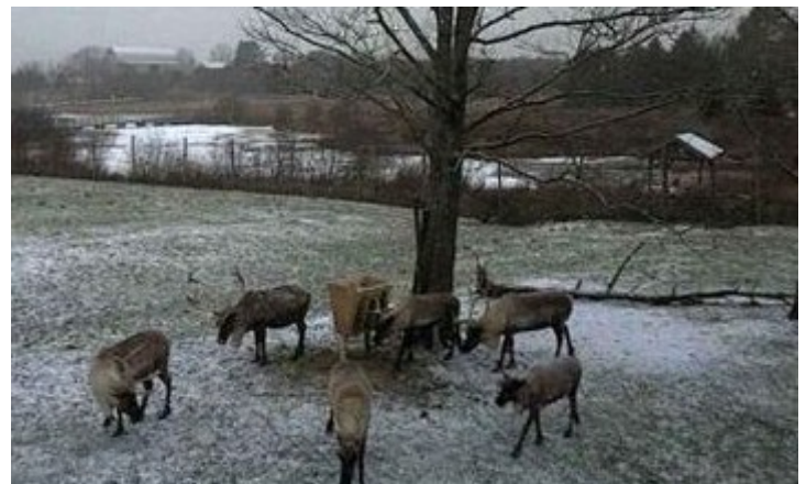
Reindeer enjoying 1st Snow

http://www.novascotiawebcams.com/reindeercam