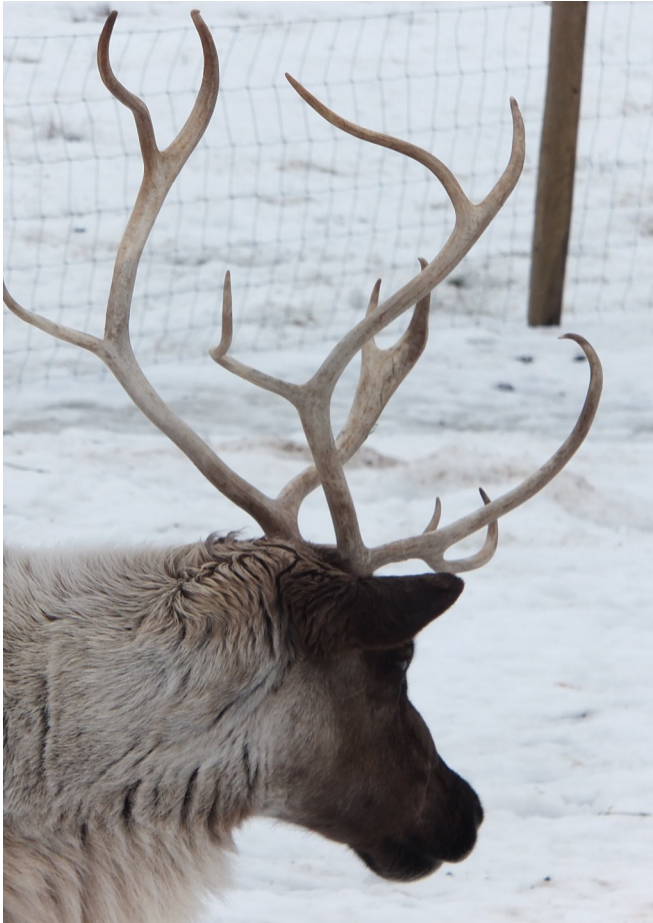
Reindeer in Winter