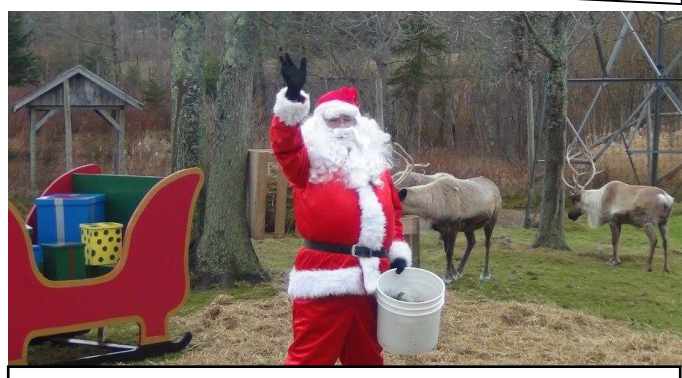
Santa checking on the Herd