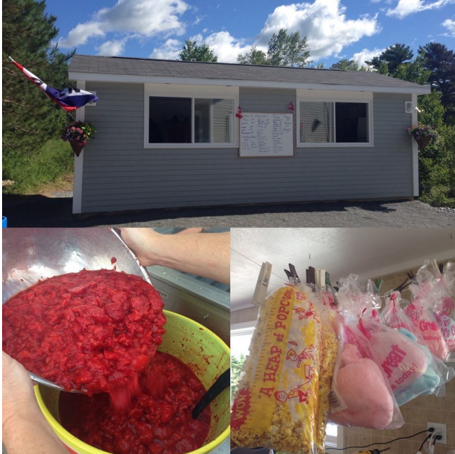
Canteen and Snacks