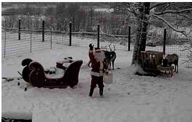
Reindeer Cam Still with festive snowfall

Once again the Reindeer Cam is up and running so viewers can check in on our reindeer 24/7. Santa himself looks in on, and feeds the reindeer twice a day at 9am and 3pm local time. It's a lot of work to get the reindeer ready for their big night.