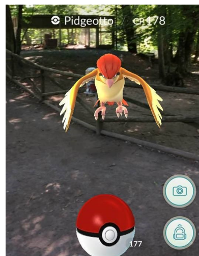
Screenshot of a Pokémon flying around near the Mink enclosure.

Perhaps the most interesting change to the Park this summer was the addition of hundreds of virtual creatures thanks to the PokémonGo app. We set lures for a day in August attracting hundreds of visitors determined to catch them all.