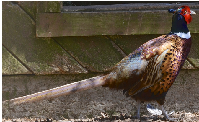
Male Ring-necked Pheasant (Cock)