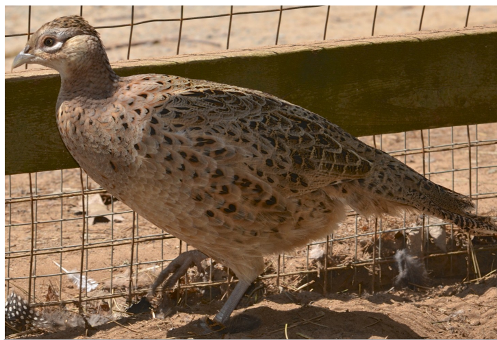
Female Ring-necked Pheasant (Hen)

Originally from Asia, like many game birds they were moved to Europe and then North America for hunting. They are now so well-established they are listed in most North American bird books and many people do not realize they aren't native.