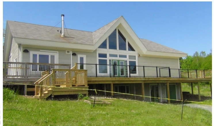
Extension to the Deck on the Wetland Centre

Both the park and the Wetland Centre remain open during the completion of these projects so we ask that you be aware of the construction areas and use caution.