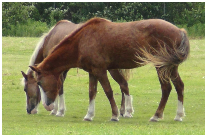
Sable Island Horse