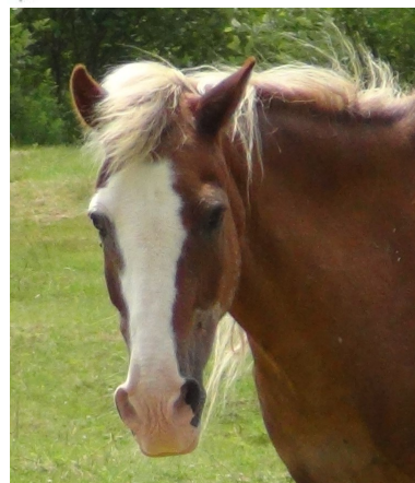
Above: Map showing Sable Island's location Below: Sable Island Horse