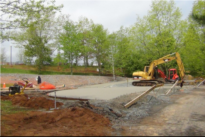
Constructing New Welcome Plaza and Entry Staff Photo

On July 28 th 2015 the Atlantic Canada Opportunities Agency (ACOA) invested funds that the provincial government and Ducks Unlimited Canada matched to go towards enhancing the visitor experience at the Wildlife Park including the Wetland Interpretive Centre. Construction began in the winter and is on-going. A major change is underway to the entrance of the park to create one central flow leading to a welcome plaza with clear signage to the different areas of the park. New directional signage will be going up throughout the park as well.